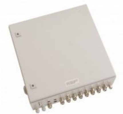
Module Cabinet MC-312